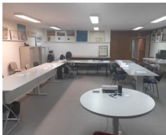
Training Room located in the Carregal do Sal Official Park - Oliveirinha